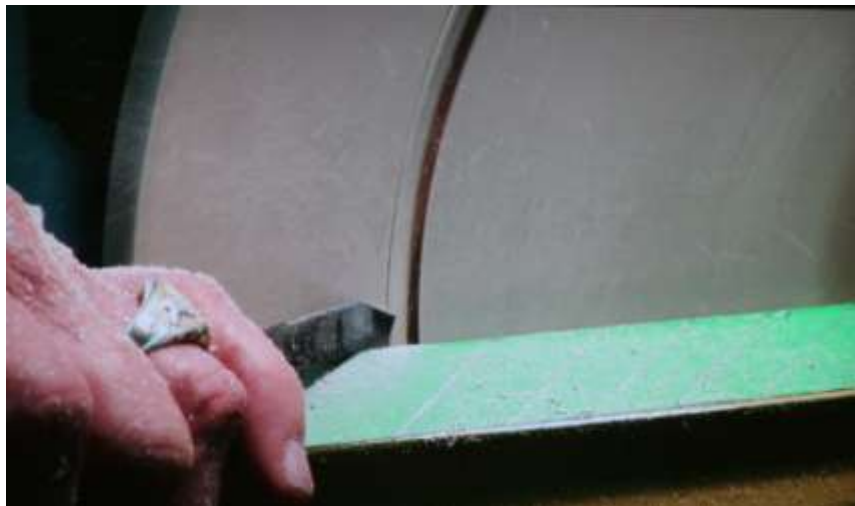
Bowl from a board instructions below: